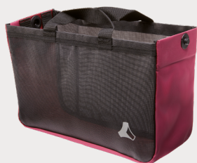
Standard bag in Amarena