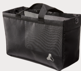
Standard bag in Black