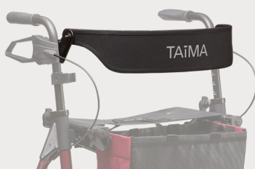
Backrest in Black