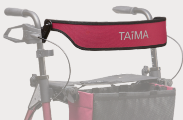
Backrest in Amarena