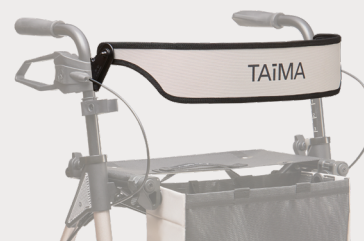
Backrest in Cashmere