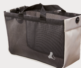
Standard bag in Cashmere