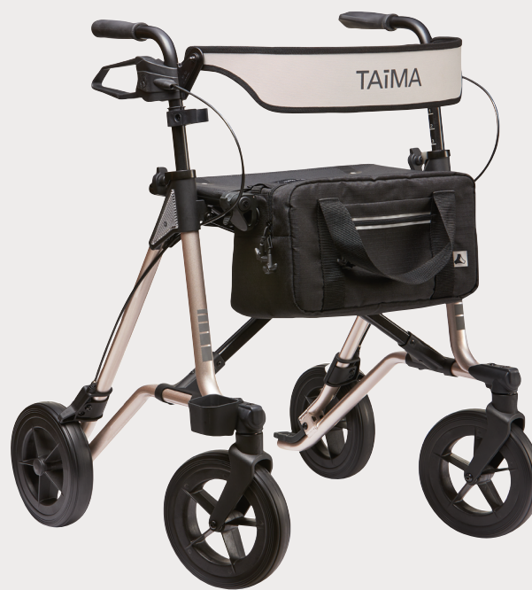
Lockable premium bag in black / Cashmere label