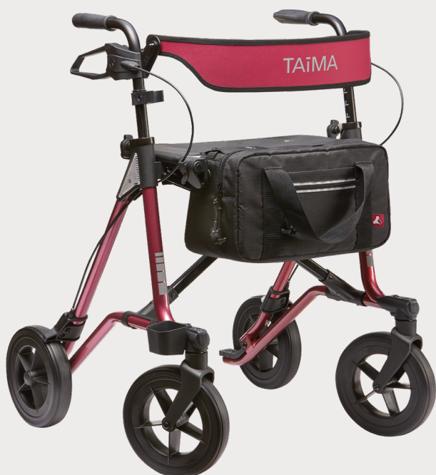
Lockable premium bag in black / Amarena label